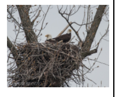
Bald Eagles nest, Reelfoot Lake State Park, see p. 6