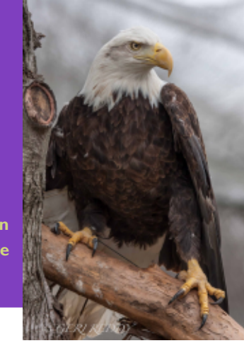
American Bald Eagle

"The planned tours included sunrise, sunset . . . scouting eagle nests . . . and photographing rehabilitated birds."